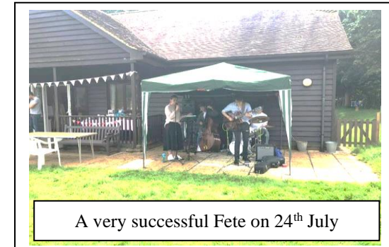
A very successful Fete on 24 th July