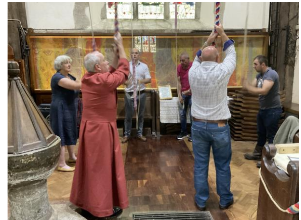
The Archdeacon joined the ringers at Dunsfold last week.