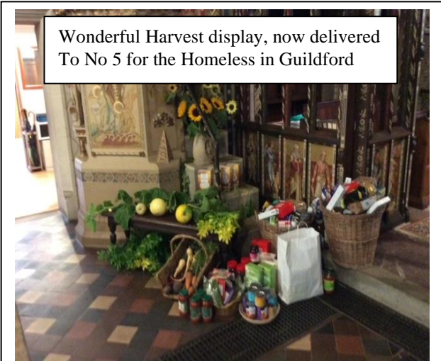
Wonderful Harvest display, now delivered To No 5 for the Homeless in Guildford