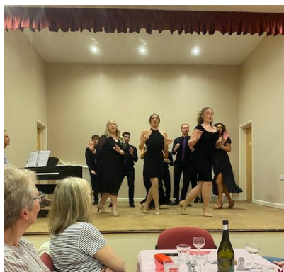
Guildford students from GSA Entertaining at Harvest Supper on Sunday 6 th October